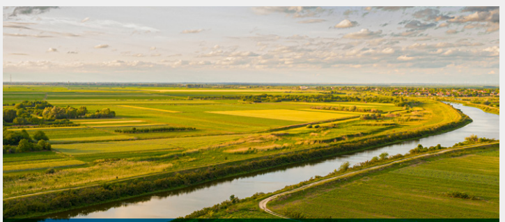
Received <u>Alliance for Water Stewardship (AWS)</u> <u>certification</u> for two additional manufacturing sites in Mexico and received our first-ever platinum certification for our facility in Taicang, China