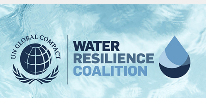
As a <u>co-founder of the Water Resilience Coalition</u> , a CEO-led movement, Ecolab continued to work collectively to address global water challenges