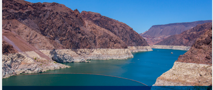
Helped fund a landmark water conservation project to help shore up Lake Mead, facilitated by the <u>Bonneville</u> <u>Environmental Foundation</u>, an Ecolab partner